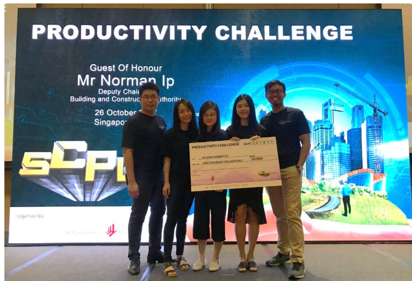
Figure 1: Team Plus from School of Design and Environment (SDE), National University of Singapore (NUS)

One of the events at the Singapore Construction Productivity Week (SCPW) 2017 was the IHL Productivity Challenge. The project-based competition required participants to propose buildable systems and construction methods which at the very minimum satisfied the Buildable Design and Constructability scores that were set out. Participants were also expected to provide a construction schedule, sequence of work, project cost estimation and Building Information Modelling or BIM model.